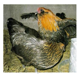
Black Gold Pair

Lyne Peterson of California provided the following excellent pictures of her black and blue gold bantams.