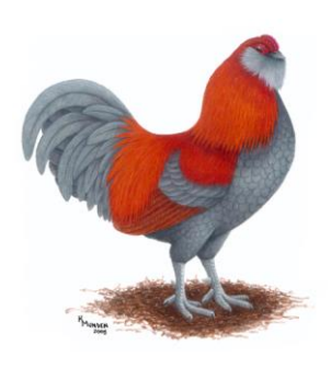
Blue Wheaten Portrait