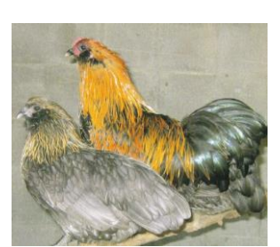
Blue Gold Hen and Black Gold Cock

Now comes the fun of feeding them and watching them develop into future show champions (at least some of them-hopefully!). We hope to go to Hutchinson, Minnesota to the national meet this fall. Hutchinson was our first national meet to show, and won with a black pullet and black trio. We've been to the national meet every year since and hope things work out this time, so we can go. My father has become very ill with a heart attack and stroke, and our fourth grandchild is due the week-end of the national meet, so we may have to miss this year.